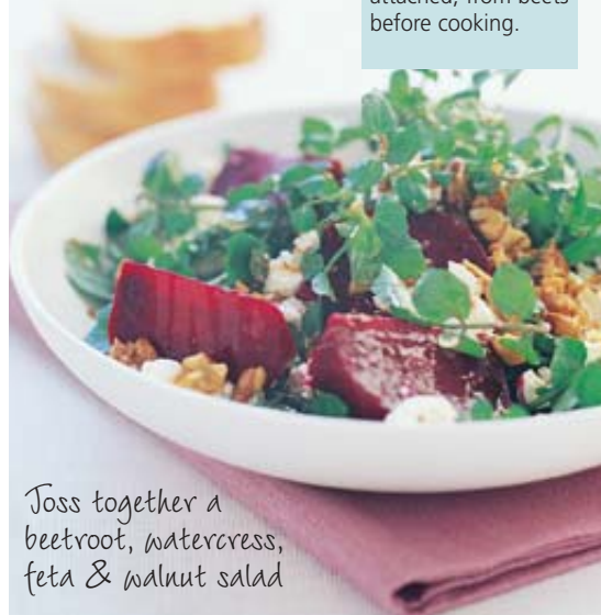
Toss together a beetroot, watercress, feta & walnut salad

Wash and trim the leafy tops and roots, leaving 3cm attached, from beets before cooking.